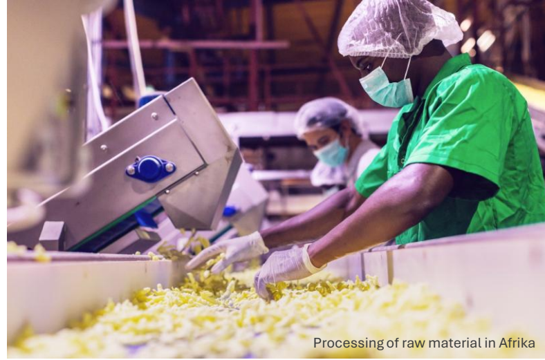
Processing of raw material in Afrika